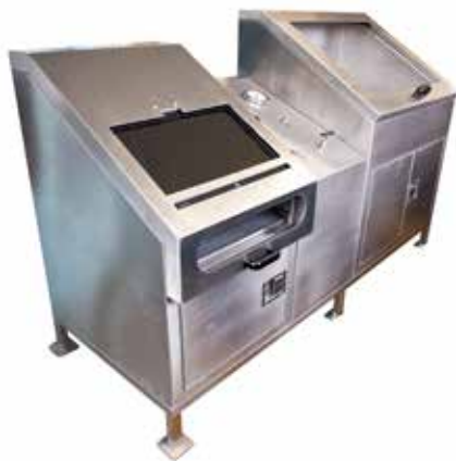
Cyclic Pressure Supply Test Unit