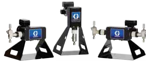
Wolverine DC and AC Pumps