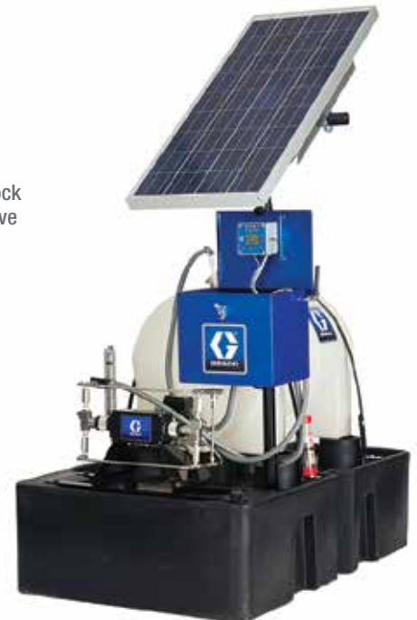
Wolverine DC Systems