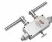
Trunion Double Block and Bleed Ball Valve