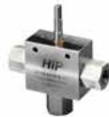
Sub-Sea Ball Valve