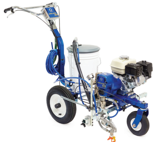
LineLazer 3400 Airless Line Striper