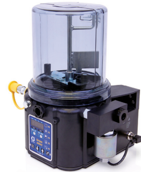
Electric Grease Jockey

All-new construction of molded, glass-filled polypropylene boosts resistance to harsh field conditions, including UV rays and temperatures up to 200 degrees F.