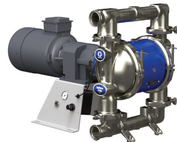
SaniForce 2150e Electric Diaphragm Pump