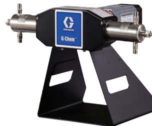
G-Chem Chemical Injection Pump