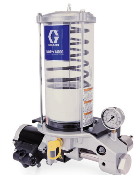
A4000 Reciprocating LubePro