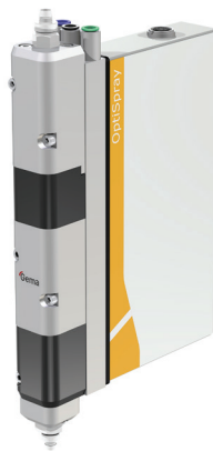
OptiSpray AP01.1 Application Pump