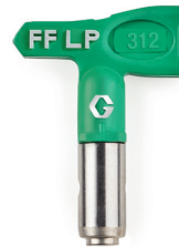
RAC X Fine Finish Low Pressure (FF LP) SwitchTips