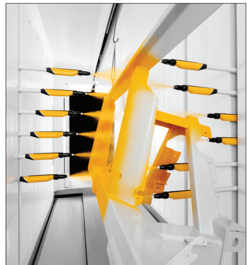
Dynamic Contour Detection System