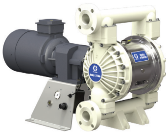
Husky 2150e Electric Diaphragm Pump