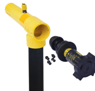
Quick-Change Orifice Plate Wellhead