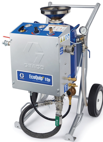
EcoQuip 2 EQp