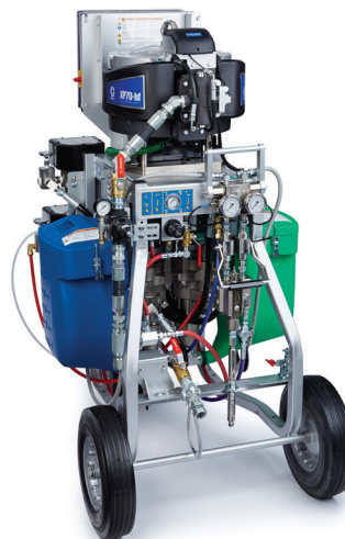
XP70-hf Plural-Component Sprayer