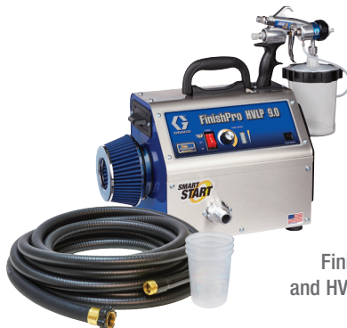
FinishPro HVLP and HVLP Edge II Guns