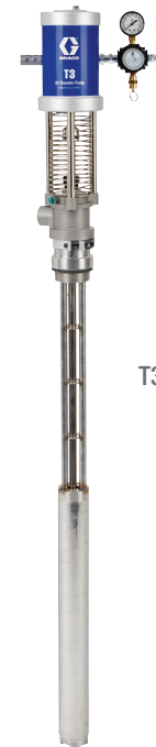
T3 Transfer Pump