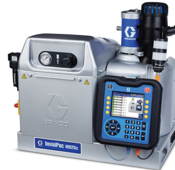
InvisiPac HM25c Tank-Free Hot Melt Gluing System

Featuring the proven Merkur® air motor and T2 pump lower, this quieter and shorter stainless steel 3:1 pump offers improved motor life and reduced maintenance versus T1 and T2 models.