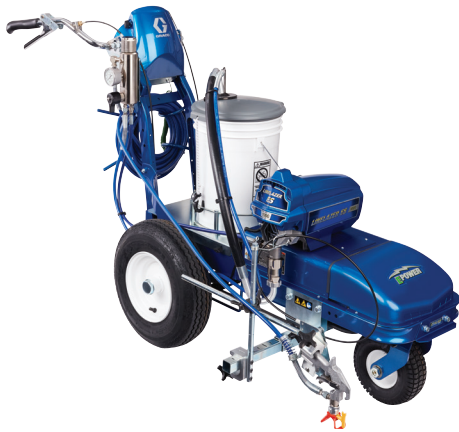
LineLazer ES 1000 Electric Airless Striper