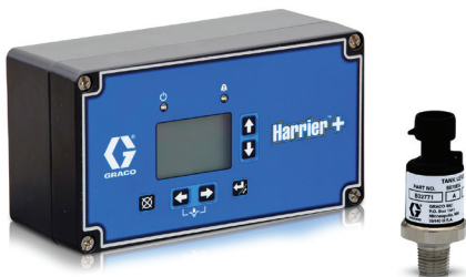
Harrier+ Controller with Tank Level Monitoring Sensor