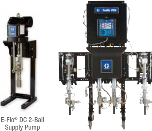
ProMix® PD2K Automatic