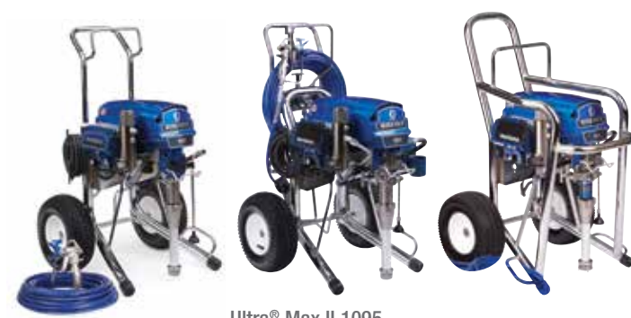
Ultra® Max II 1095 Standard, ProContractor, IronMan