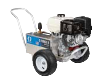
G-Force™ II 4040 BD