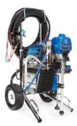
FinishPro™ II 595 PC Pro