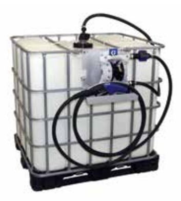
SD Blue Pneumatic DEF Package